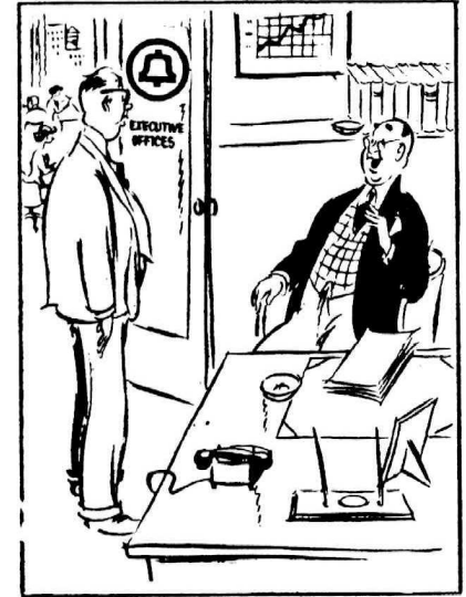
"Don't let your million dollar goof worry you, Rafferty, We'll Increase the rates a dollar a month on all our customers' bills!"

Bulk Rate U.S. POSTAGE PAID Permit No. 3 Keasbey, N. J.