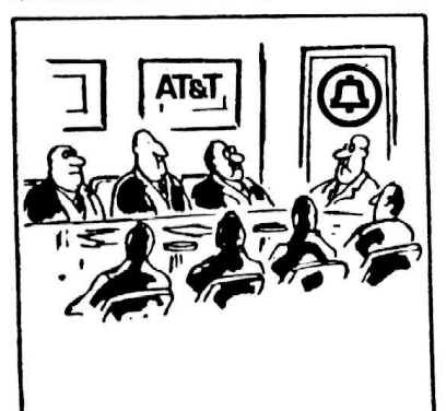
en, I just wanted to remind you that the home office will be monitoring this on class d-circuit TV, the les department is recording this for future use, and ie of us here is an FBI agent."