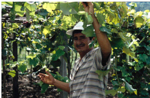
Figure 1: Advice from ITDG Latin America helped improve the grapes and the yields of this wine producer in Peru.

The production of grape wine involves the following basic steps: crushing the grapes to extract the juice; alcoholic fermentation; maltolactic fermentation if desired; bulk storage and maturation of the wine in a cellar; clarification and packaging. Although the process is fairly simple, quality control demands that the fermentation is carried out under controlled conditions to ensure a high quality product.