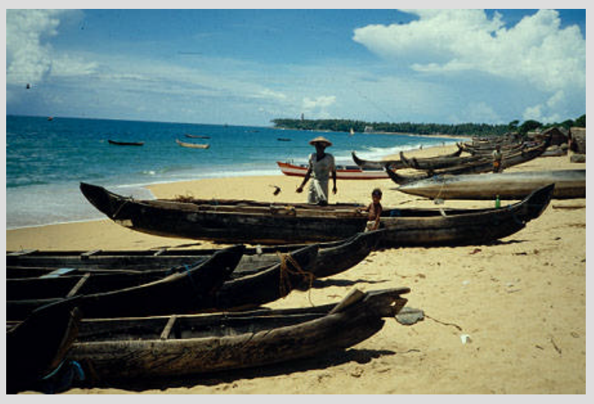
Figure 2: Traditional boats in South India

This is the main craft type of South Kerela and the Kanyakumari District of Tamil Nadu, where the South West Monsoon surf conditions are the most severe. Literally a tied-log raft (in the Tamil Language Marram means log, and Katu means tied). It is constructed if light-weight timber logs (Albizia or Kapok) which are shaped and lashed together to form a very sea-worthy craft.