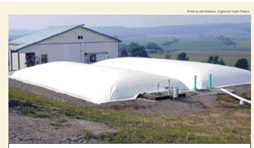
Photo 1 . Beneath the polypropylene covers, waste is digested anaerobically. The diary owners harvest the methane for energy production, which powers the operation. Excess energy is sold back to the area grid.

The digestion chambers are each covered by 45 mil, scrim-reinforced polypropylene geomembranes. The membranes are manufactured in an extrusion process that com-