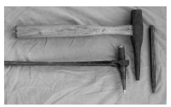
Some different styles of punches

Make a center punch mark in the center of the bar 3" from its end. Take a bright yellow heat where the bar is center punched. Place the bar flat across the face of the anvil, center punch mark up. Carefully place the punch over the center punch mark. Strike a single solid blow to sink the punch into the hot bar. Make sure the end of the punch is still where it is supposed to be. Continue striking solid blows until the punch is nearly through; another