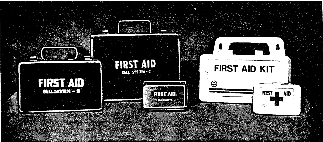
Fig. 1—First Aid Boxes Presently in Use