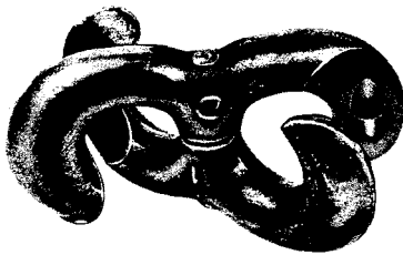
Fig. 1 — B Connecting Link — Open Position