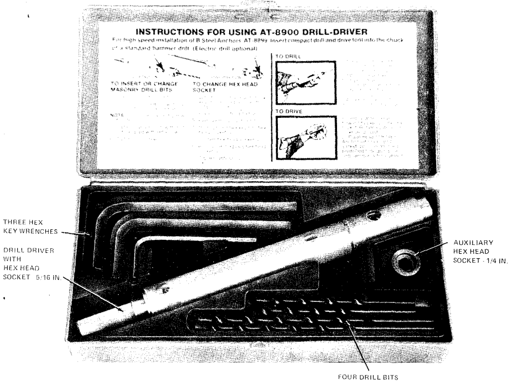
Fig. 2—C Drill Driver Kit