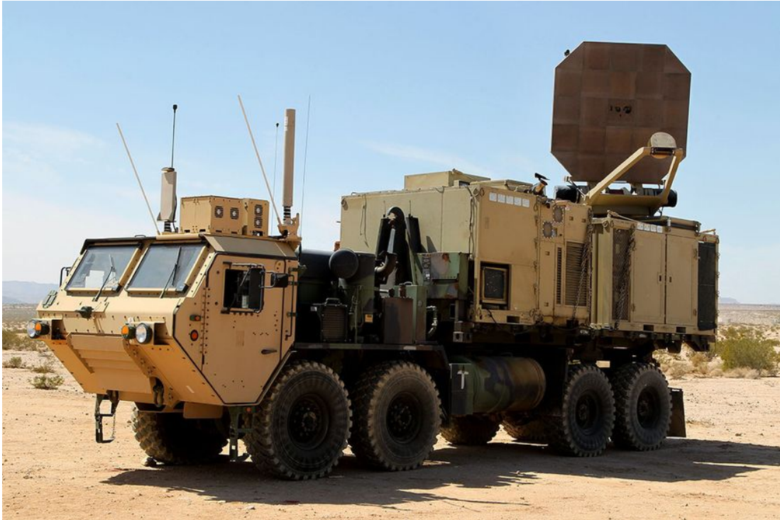
Figure 1. Solid State Active Denial System. 339

flee. 337 The sensation immediately subsides once outside the RF beam. The most common usage is crowd control, and this technology could easily be transferred to law enforcement organizations throughout the country. In demonstration videos, the system is mounted onto a vehicle, but with more development could be miniaturized, carried on an individual person, and used for more nefarious purposes. 338