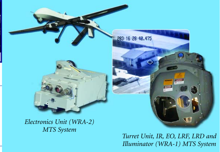
Electronics Unit (WRA-2) MTS System