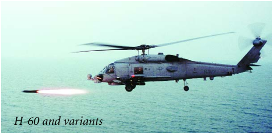
H-60 and variants